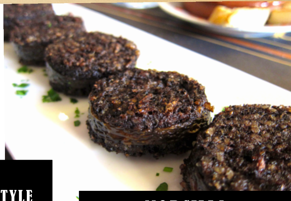
MORCILLA (SPANISH BLACK PUDDING)