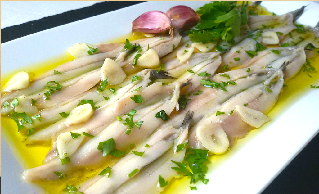
BOQUERONES (WHITE ANCHOVIES) 500mg