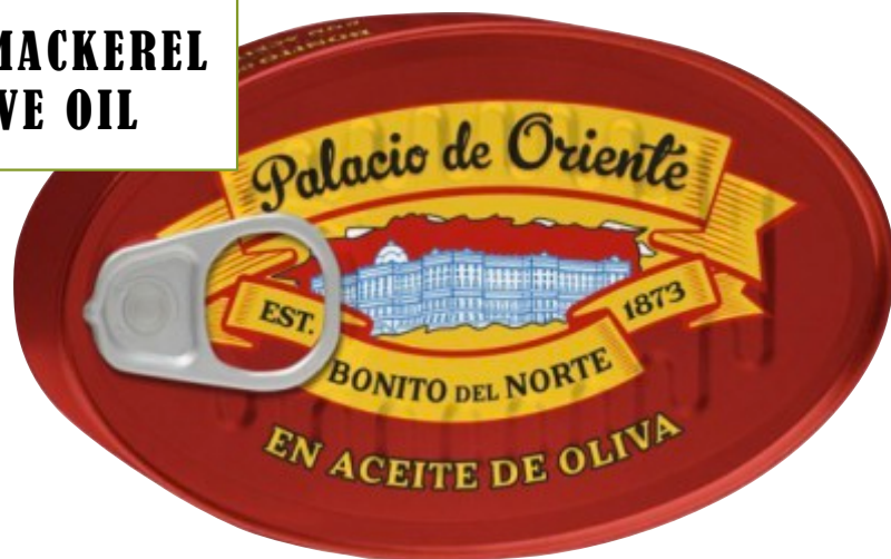
SPANISH MACKEREL IN OLIVE OIL