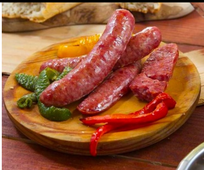
PORK SAUSAGE CATALAN TRADITIONAL STYLE