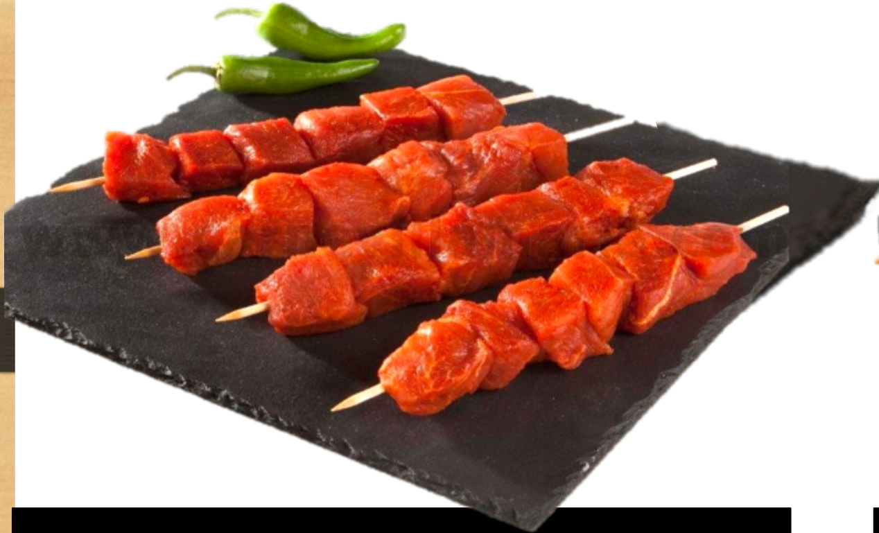
MARINATED DICED PORK