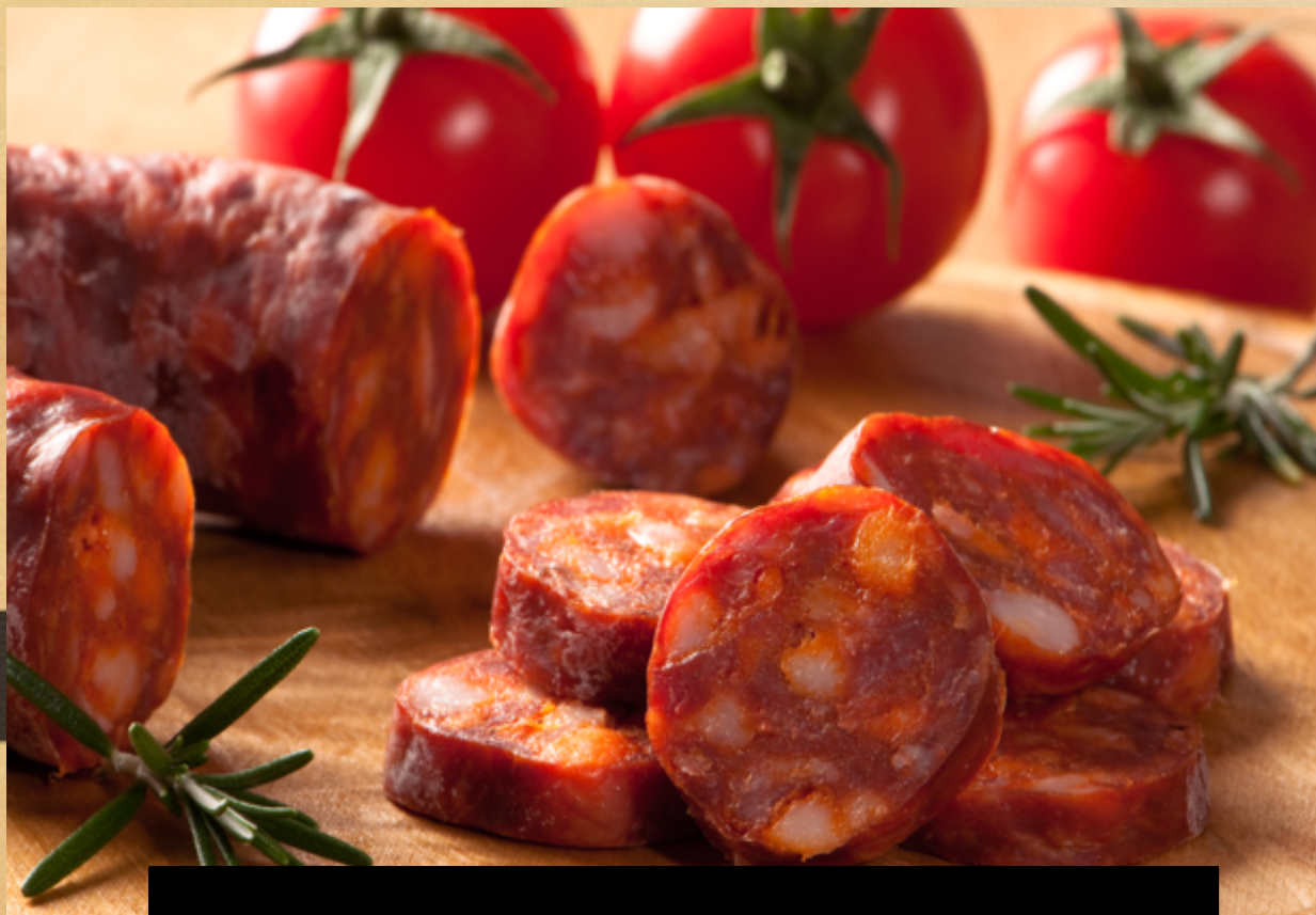
HOT DRY CHORIZO