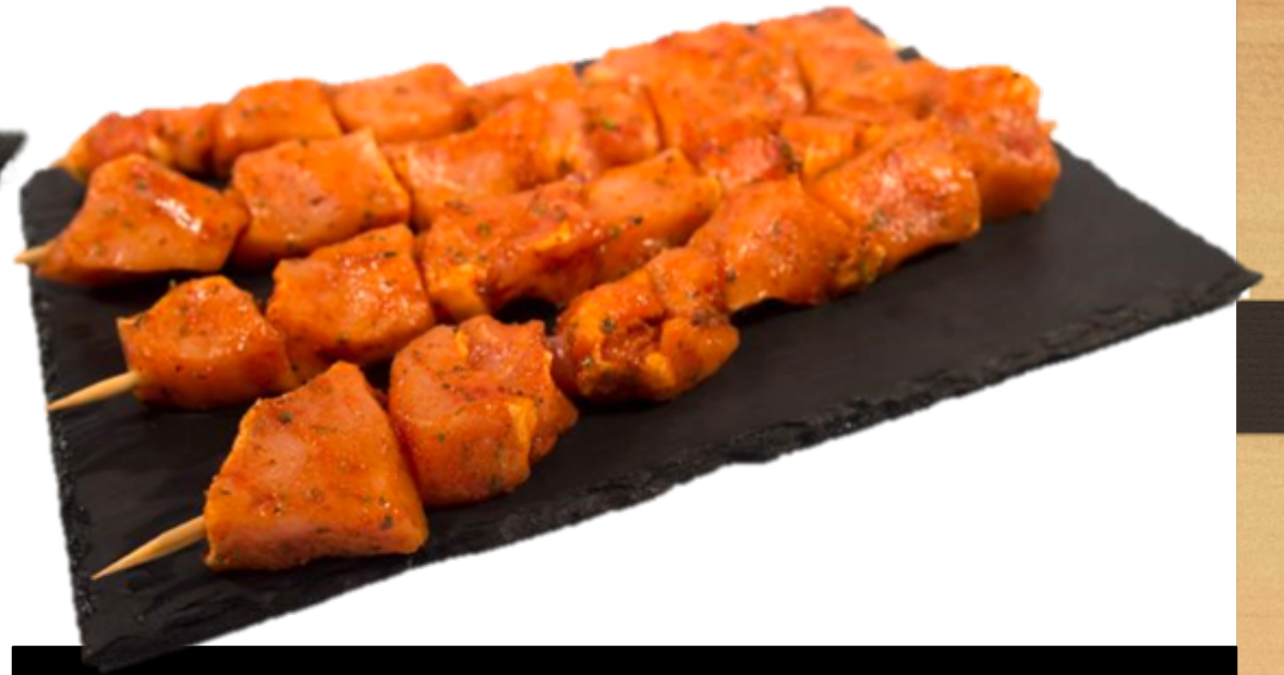
MARINATED DICED CHICKEN