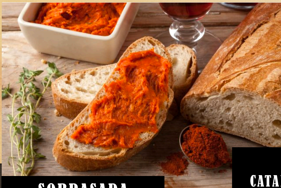
SOBRASADA (CHORIZO PATE)