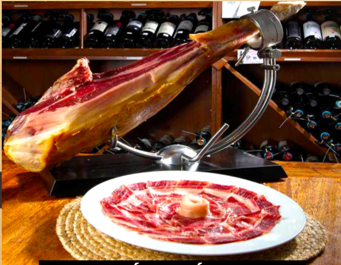
JAMÓN IBÉRICO (24 AGED)