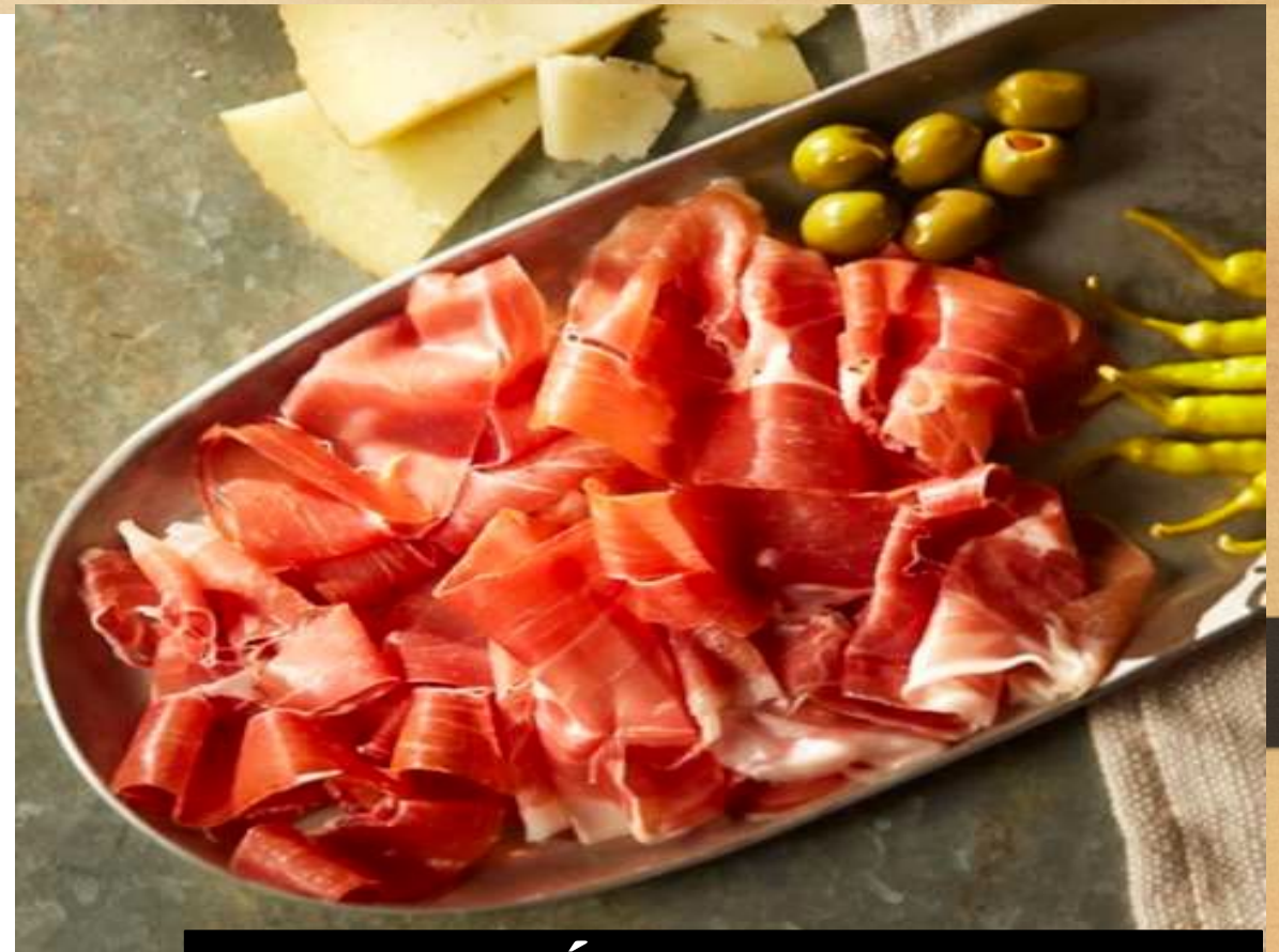
JAMÓN SERRANO (11 AGED)