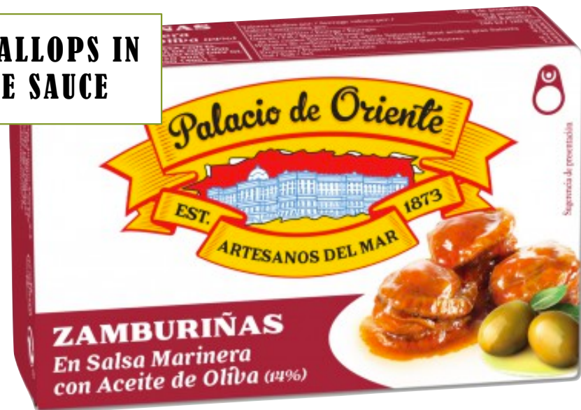
BABY SCALLOPS IN MARINE SAUCE