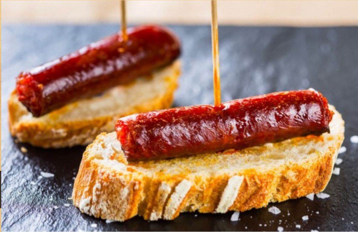
TXISTORRA (PORK BELLY CHORIZO)