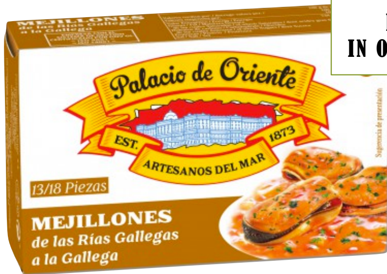
MUSSELS IN ONION SAUCE