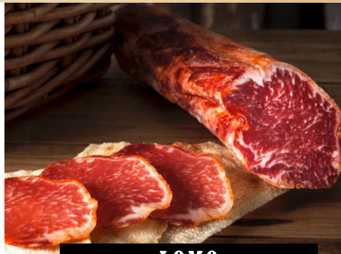
LOMO (CURED LOIN)