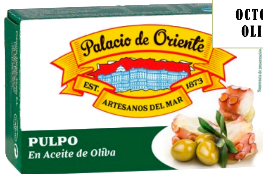
OCTOPUS IN OLIVE OIL