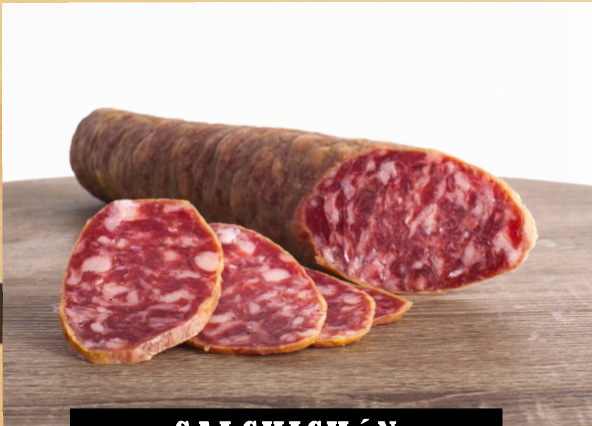
SALCHICHÓN (SPANISH SALAMI)